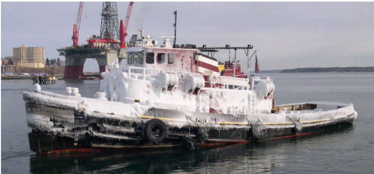
The JEFFERY McALLISTER arrives at her new home in balmy Portland Maine

PLEASE BE INFORMED THAT OUR PSINKE1@CHELLO.NL E-MAIL ADDRESS WILL BE DISCONTINUED SOON, AS PER TODAY OUR E-MAIL ADRES IS : psinke@xs4all.nl or psinke@worldonline.nl PLEASE CHANGE YOUR ADRESSBOOK