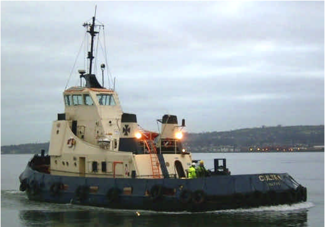
The Svister tug CULTRA operating in the Port of Belfast Originally built for service on the River Tees in the North of England the CULTRA and her sister tug CARRICKFERGUS are due for replacement during this coming year