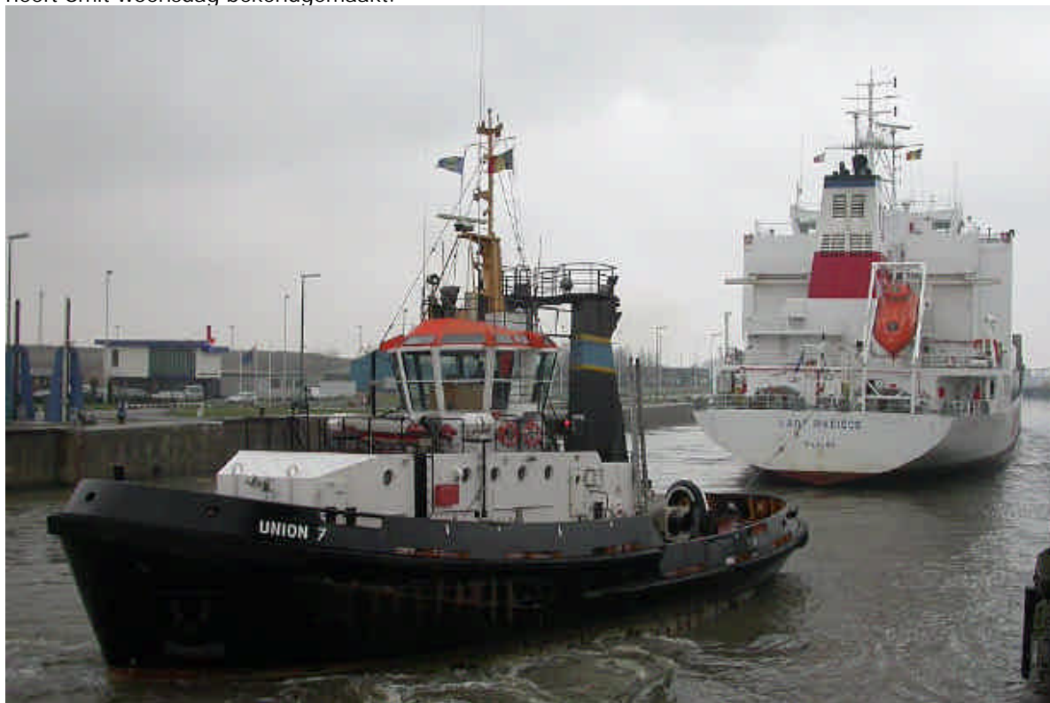
Top : de UNION 7 assisteert de LADY RACISCE

Sleep- en bergingsbedrijf Smit Internationale heeft 50 procent van de aandelen van dochterbedrijf Unie van Redding- en Sleepdiensten (URS) uit Antwerpen verkocht aan Fairplay Towage uit Hamburg. Dat heeft Smit woensdag bekendgemaakt.