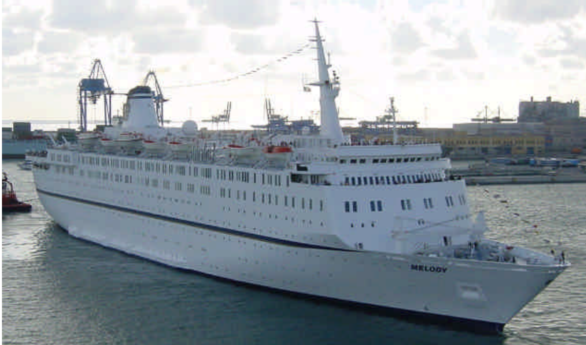
Top : The MELODY seen here arriving in the port of Genoa

company's U.S. operations based in Moonachie, N.J. "We have ambitious plans."